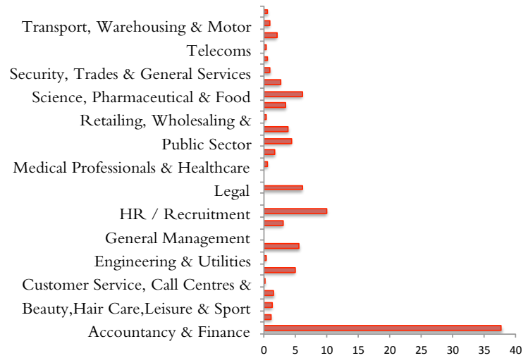
Figure: All jobs offered in Galway in Q2 2011, % of total advertisements in this period.

All data are for corporate (not agency) jobs advertised on Saongroup.com Ireland, which operates IrishJobs.ie and Jobs.ie.